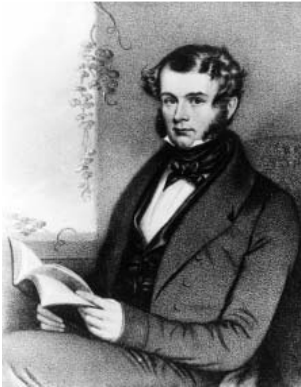
Figure 6: Hugh Edwin Strickland in 1837 (JARDINE, 1858).

Figura 6: Hugh Edwin Strickland en 1837 (JARDINE, 1858).