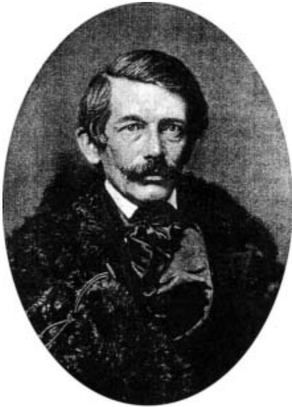
Figure 3: J.G. Kohl in 1854 (ANELLI, 1940).