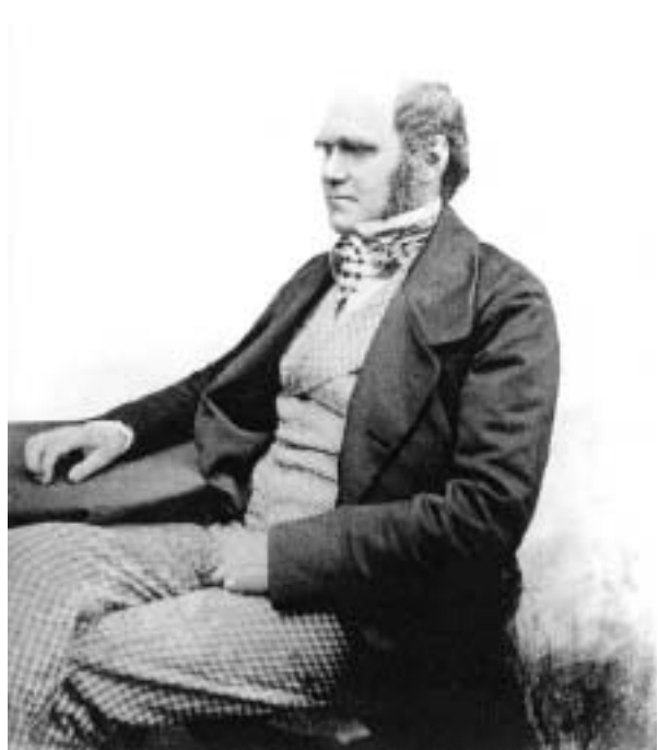
Figure10: Charles Robert Darwin, probably in the early 1860s.

Figura 9: William Henderson en 1876 o potser abans (HENDERSON, 1879).