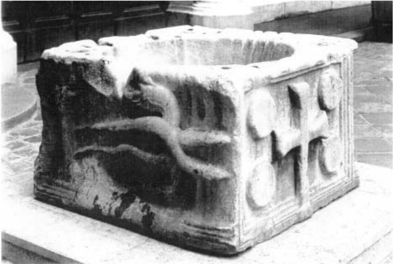
Figure 1: Two supposed Proteus carved in a stone well-head of the 10 th or 11 th century, once near San Nicolò church at the Lido, Venezia, and now in the Kunsthistorisches Museum in Wien (Inv. No. 6825).