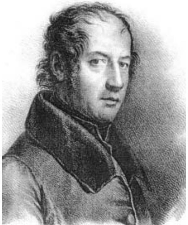
Figure 4: Pietro Configliachi.

"...Some living specimens, which I saw in the possession of a peasant in Adelsberg, were about eight inches [20